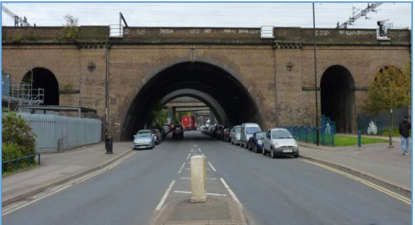
Grade II listed railway bridge, 1838, by Robert Stephenson. Viaduct from the London & Birmingham Railway, carrying the main line from Euston. In the OPDC planning area of responsibility.