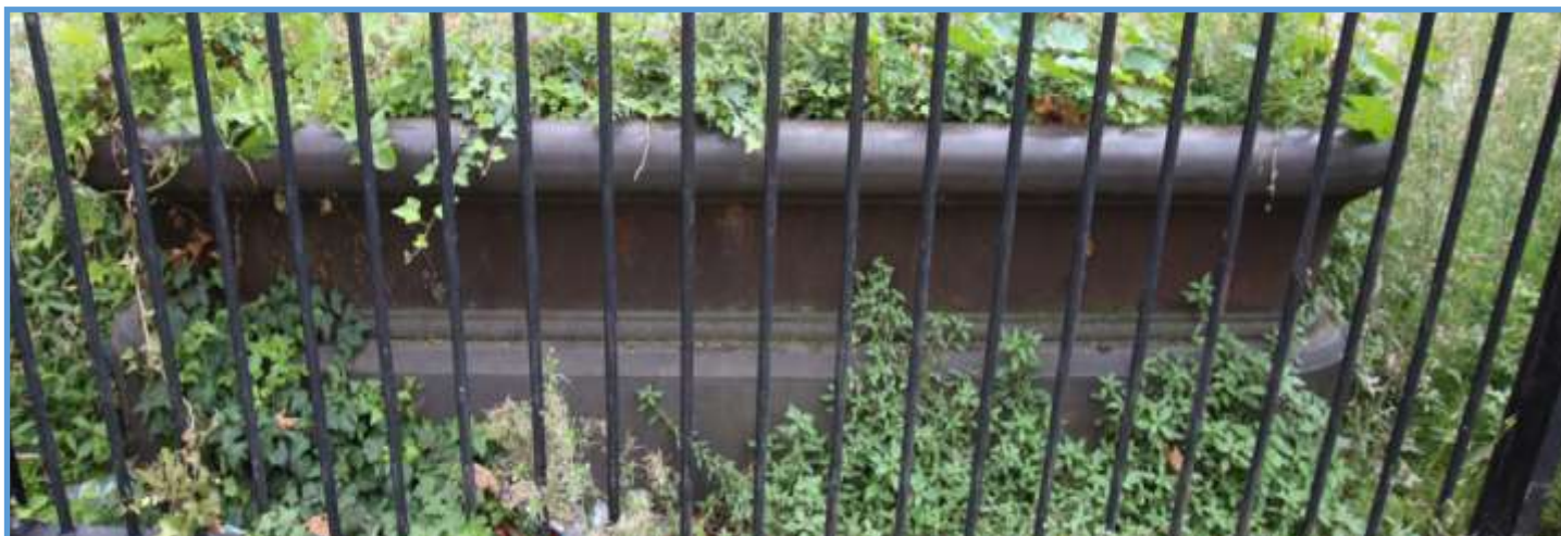
Grade II listed C19 cast iron water trough outside the Masons Arms on Harrow Road, Kensal Green

Objective 6: Special regard will be given to proposals where they are considered to affect sites within Archaeological Priority Areas and Sites of Archaeological Importance.