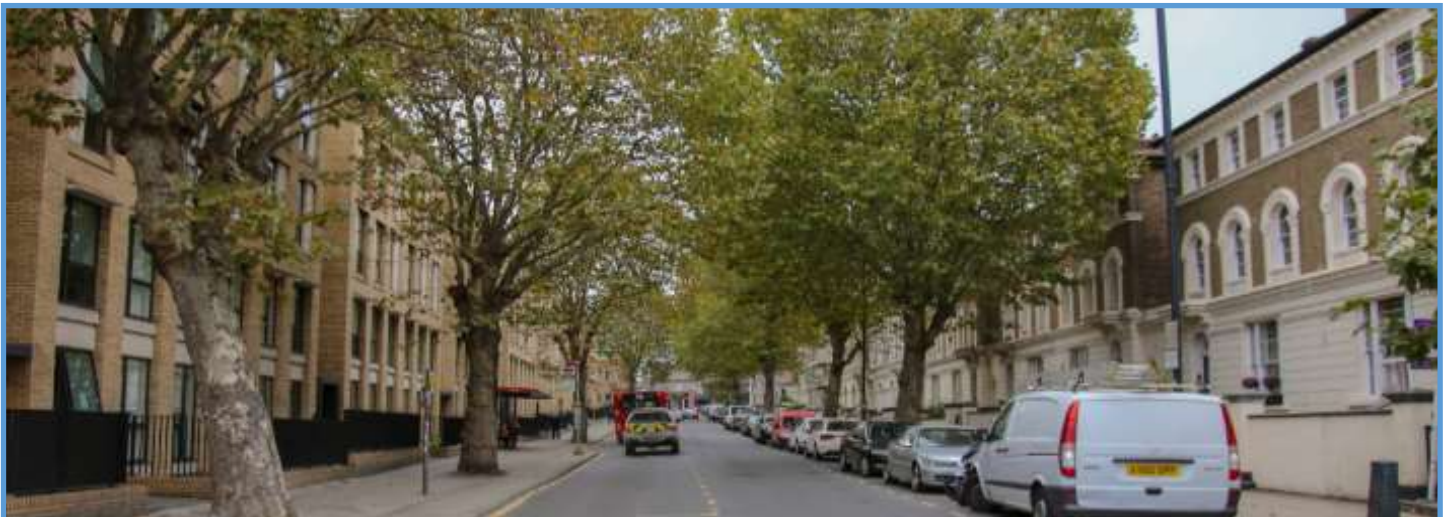
Left, low rise modern housing constructed in 2015 by architects Lifschutz Davidson Sandilands