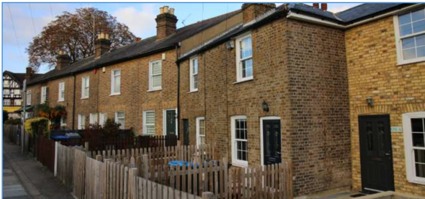
A modest group of C19 brick cottages in Watford Road, Sudbury.