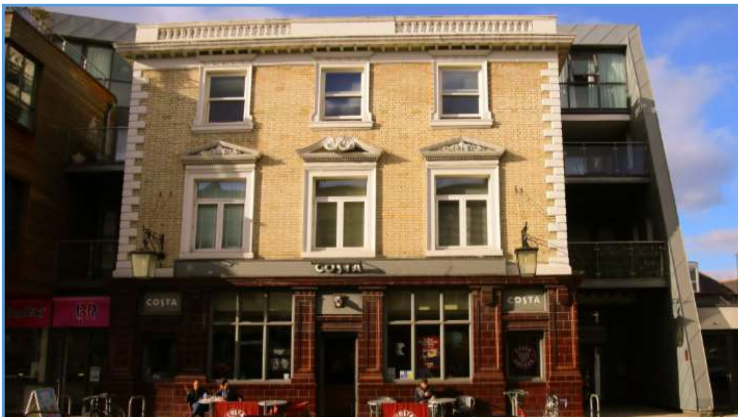
Locally listed former Spotted Dog Pub, High Road Willesden, 1881 by H W Hexton converted and extended for new uses in 2014.