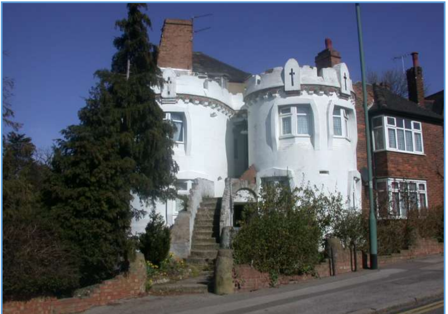
Local listed maisonettes in Wakemans Hill Avenue designed by Ernest George Trobridge in 1935. An iconic Trobridge 'castle', featuring rising entranceway steps between two drum towers.