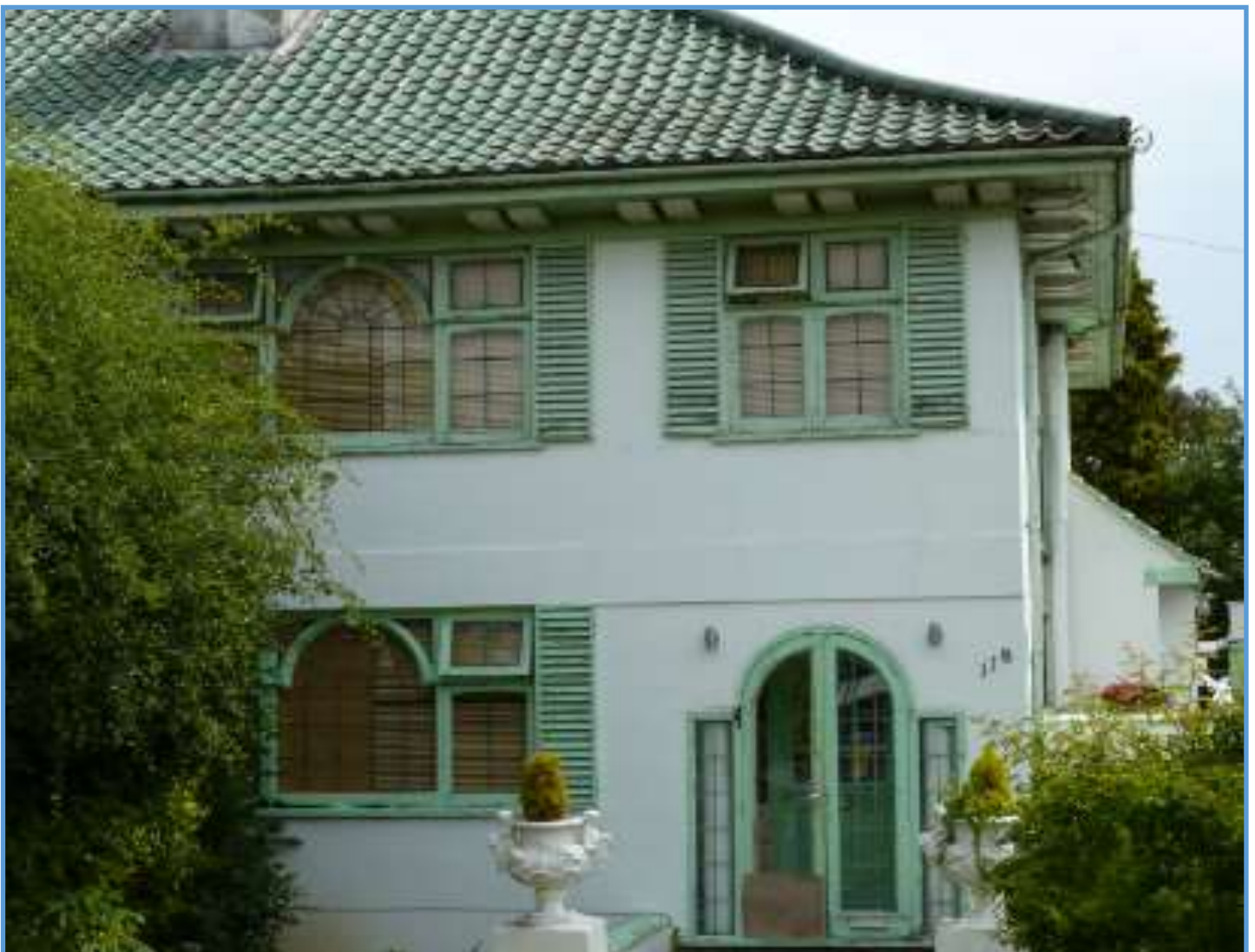
Moderne houses enlivened by bright green pan tiles in the Sudbury Court Conservation Area.