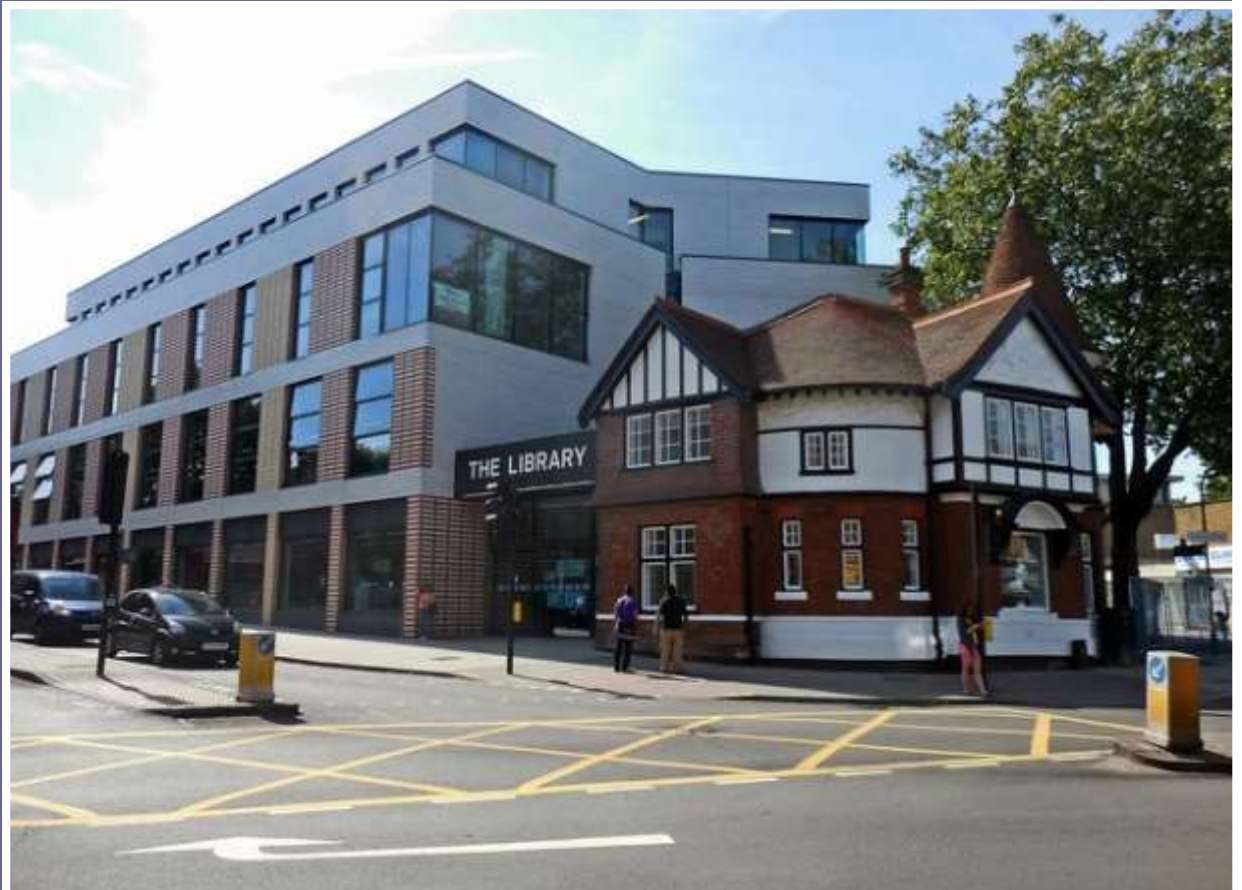
The Willesden Green Cultural Centre (2015) by Allford Hall Monaghan Morris returns to use the Locally listed Victorian Library blending perfectly the old and the new.

Assessing and managing Brent's built heritage to support good growth and help inform regeneration and place-making