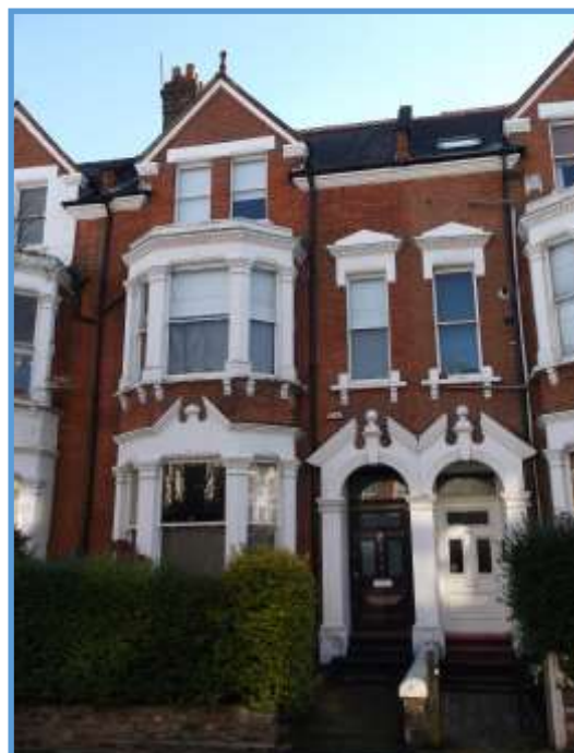
Victorian terrace housing in the North Kilburn Conservation Area.