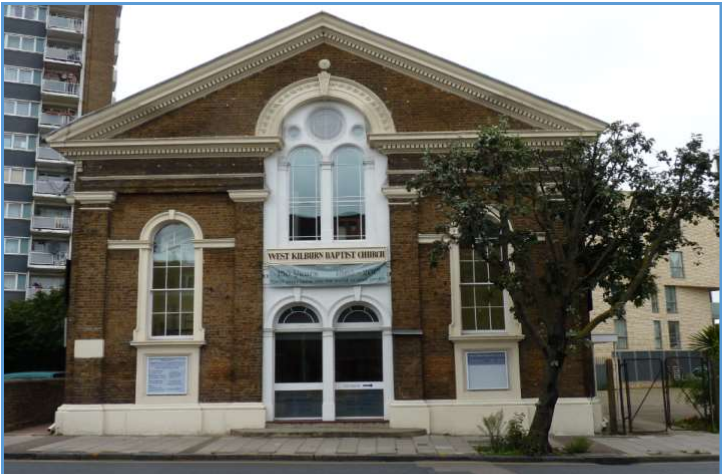
Locally listed. West Kilburn Baptist Church, 1865 by C Hall.

3.4 Supplementary Planning Documents (SPDs) and Guides provide guidance on the Council's planning policies and processes in conservation areas, and are capable of being 'material considerations' in determining planning applications. The Council has adopted a number of Conservation Area Guides and Character Appraisals for all its conservation areas. The need for individual Conservation Area Guides is discussed in relation to each individual conservation area contained within Appendix A. A review of the Character Appraisals is discussed in paragraph 18.4.