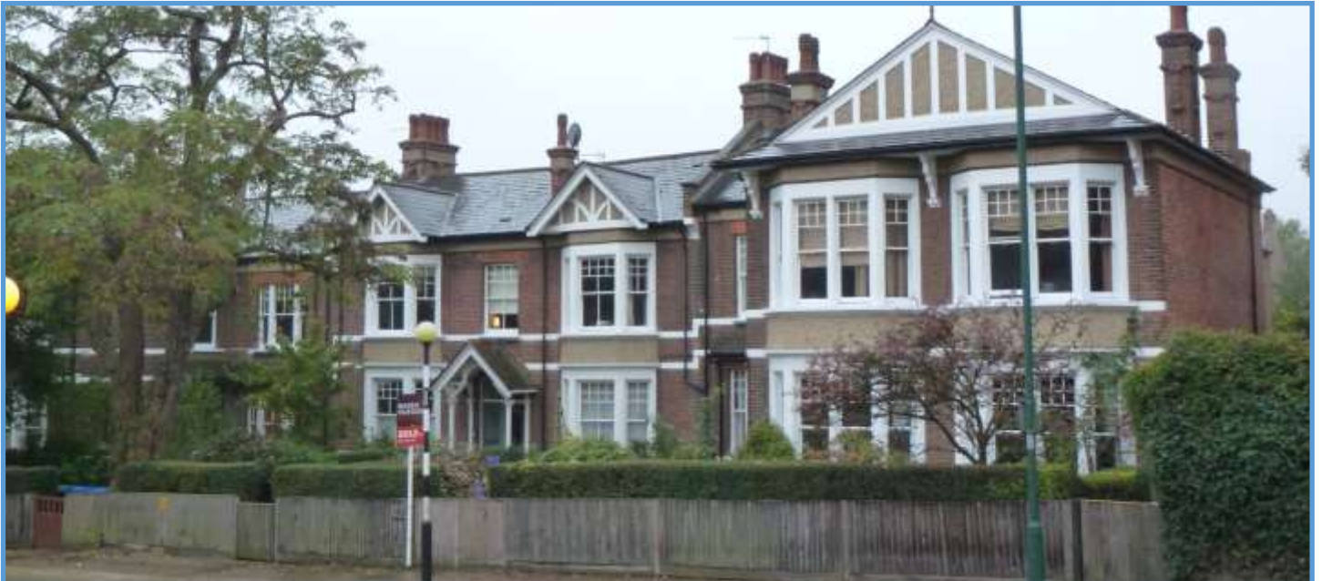
Proposed for Local List: Brondesbury Park Mansions, Salusbury road, NW6 6PD

Objective 3: Work with communities, residents' associations and local history societies to thematically identify potential candidates for the Local List, based on the Borough selection criteria.