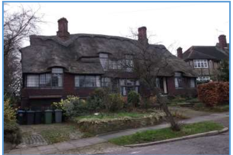
3 and 5 Buck Lane, Buck Lane Conservation Area.