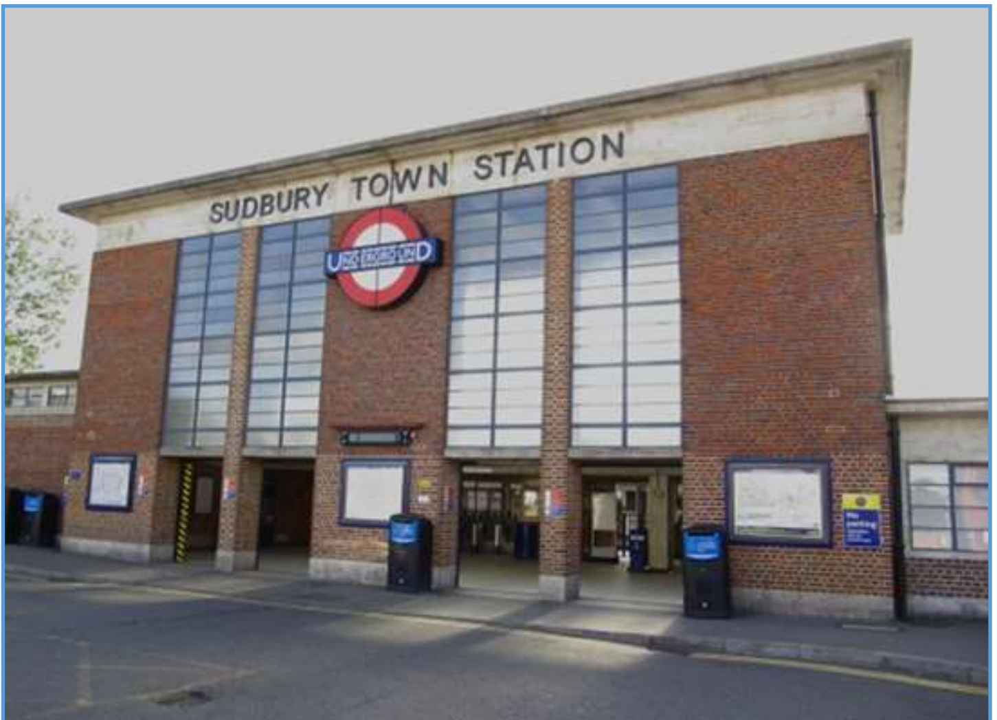
Grade II* listed Sudbury Town Underground Station. Designed in 1931 by Charles Holden, it was the prototype for his ground-breaking Modernist designs for the Piccadilly Line extensions. In 2017 TFL undertook forecourt/bus interchange improvements which included the replacement of a number of missing Charles Holden lamp columns.