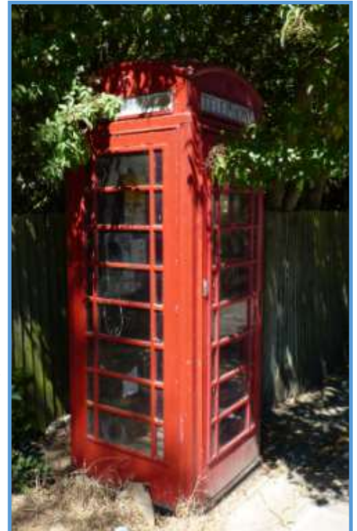
Grade II listed telephone kiosk (Type K6) in Stag Lane. Designed 1935 by Sir Giles Gilbert Scott.