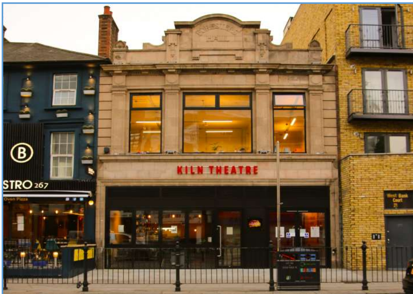
Locally listed Kiln Theatre on Kilburn High Road showing detail of the refurbished 1929 Foresters' Hall façade and new shopfront.