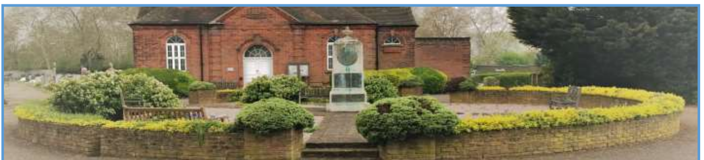
Grade II listed. Willesden Liberal Jewish Cemetery War Memorial.